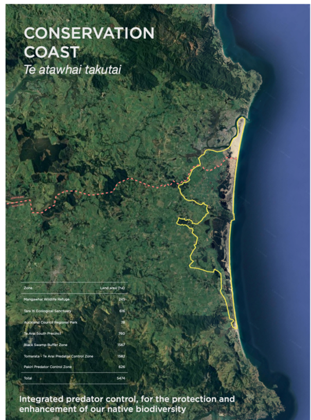
Conservation Coast: A integrated approach for predator control. Combined, the seven zones represent almost 5500ha under predator control, creating a vast conservation corridor linking the Auckland and Northland regions.